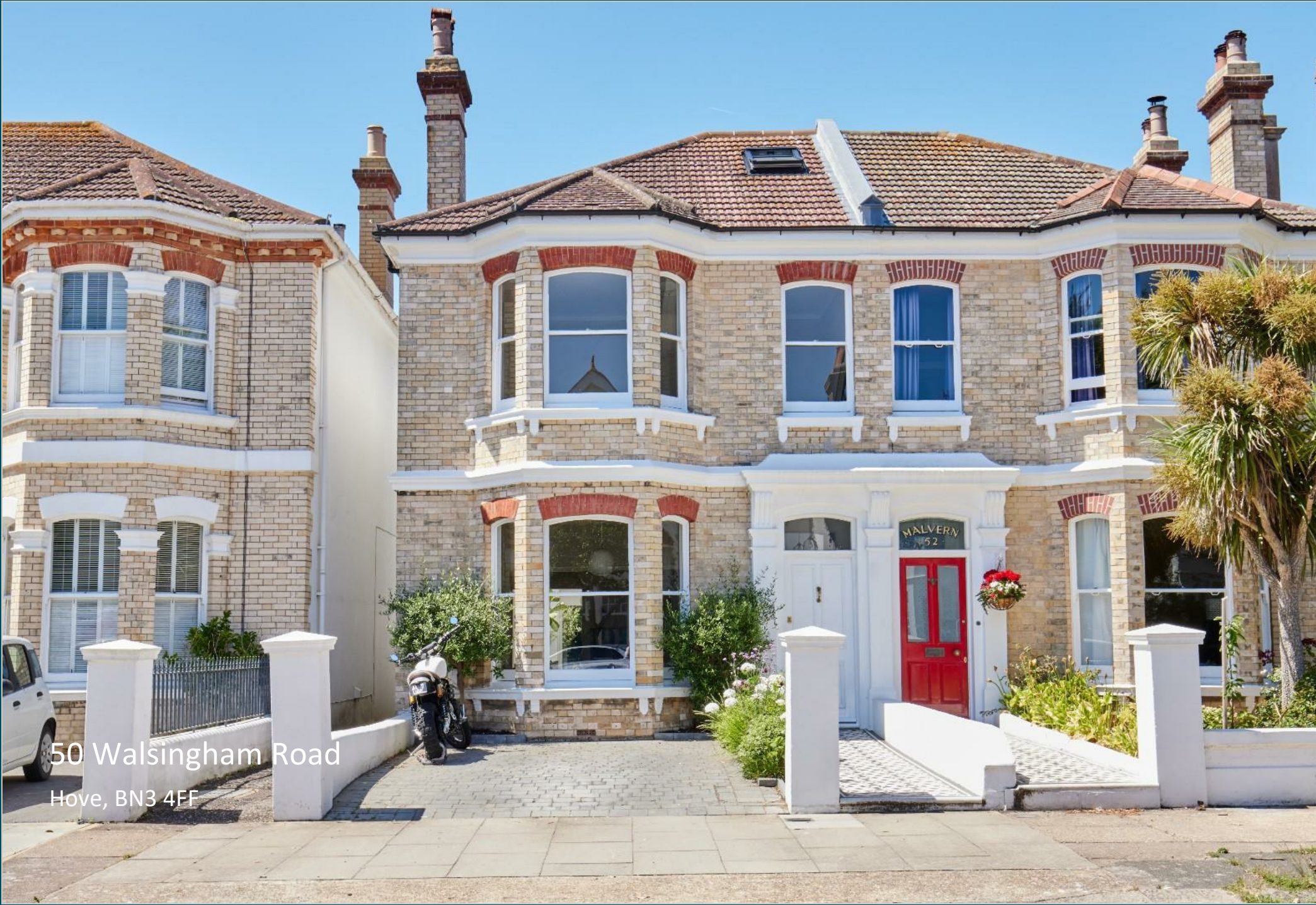
50 Walsingham Road Hove, BN3 4FF